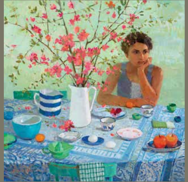
(ABOVE LEFT) TONY ARMENDARIZ (b. 1964), Feeding Nairobi , 2020, watercolor on paper, 18 x 24 in., private collection ■ (ABOVE RIGHT) AIMEE ERICKSON (b. 1967), Something to Think About , 2019, oil on canvas, 30 x 30 in., private collection ■ (BELOW) NARELLE ZELLER (b. 1978), Bury Me with a Mandarin , 2018, oil on ACM panel, 23 3/5 x 31 1/2 in., 33 Contemporary Gallery (Chicago)