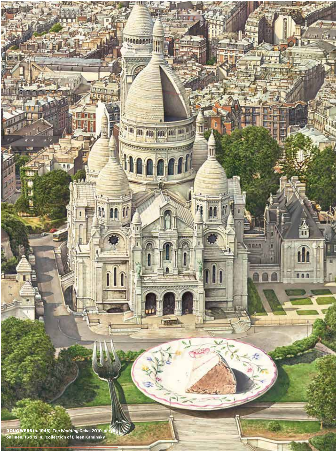
DOUG WEBB (b. 1946), The Wedding Cake , 2010, acrylic on linen, 16 x 12 in., collection of Eileen Kaminsky