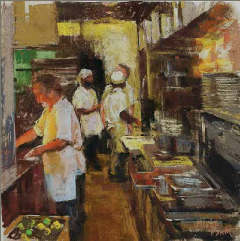
(CLOCKWISE FROM TOP LEFT) THALIA STRATTON (b. 1957), Waiter in Repose II , 2019, oil on canvas, 16 x 12 in., available through the artist ■ JILL BANKS (b. 1958), After Hours , 2020, oil on linen, 36 x 24 in., available from the artist ■ RAY HASSARD (b. 1949), Food, Glorious Food , 2014, pastel on panel, 16 x 12 in., private collection ■ NANCIE KING MERTZ (b. 1952), If You Can't Stand the Heat, Get Out of the Kitchen , 2017, pastel on uArt 400, 10 x 10 in., available through the artist